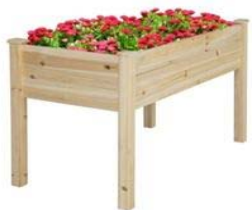
Elevated Garden Bed found at amazon.com or Walmart.com for under $100

I mentioned above I have a small elevated garden. These are especially great for people who can't stand a long time, who use mobility aids (wheelchair, cane, scooter, etc.), or just want to have easier access to care for their plants without getting up and down from the ground and/or having to bend.